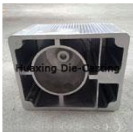
Product Name:machine parts Product Mode:13