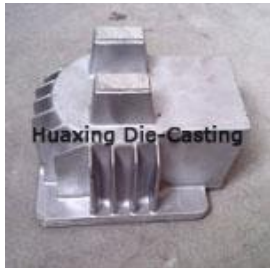
Product Name:machine parts Product Mode:16