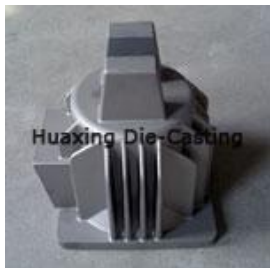
Product Name:machine parts Product Mode:15